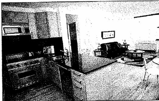
STEEL YOURSELF: Kitchens at Lookout Hill offer Viking appliances.

My Sunday afternoon started at 145 Park Place, located just off Flatbush in Park Slope (huge bonus points for the Duane Reade around the corner). For a new condo building, it's a bit bare-bones (no gym, for example), but the value here is huge. Unit 1D, lowered from $645,000 to $615,000 a couple weeks ago, is 1,060 square feet. I was leery of the one-bedroom D units before I visited, because their only windows face a courtyard, but when I checked out 2D (also 1,060 square feet, priced at $625,000) there was more than adequate light. And the L-shaped living/dining area is pretty massive (535 square feet) for a one-bedroom apartment.